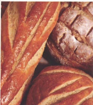
New dietary guidelines for diabetes, page 46