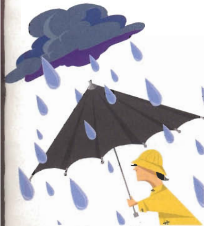
Rain boosts ED admissions, page 34

Act fast to treat potentially fatal carbon monoxide poisoning.